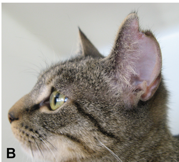
Figure 2 —Photographs illustrating unilateral ear tipping to indicate that a community cat has been neutered (A) and showing a community cat with an injured ear flap (B). Ear tipping, rather than notching, is recommended to identify neutered community cats, because ear tipping results in a distinctive straight edge whereas ear flap injuries may easily be mistaken for surgical ear notching.

be returned to their traps or transport carriers while unconscious for recovery monitoring. In this case, cats should be carefully monitored to ensure that movement or turning in the confined space during recovery does not compromise airway patency; gentle rocking or tilting of the trap or carrier may be necessary to safely reposition the cat's head and neck.